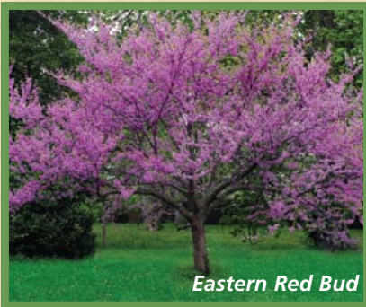
Eastern Red Bud

Reaches 30' in height, with red twigs and beautiful purplish-pink flowers in the spring.