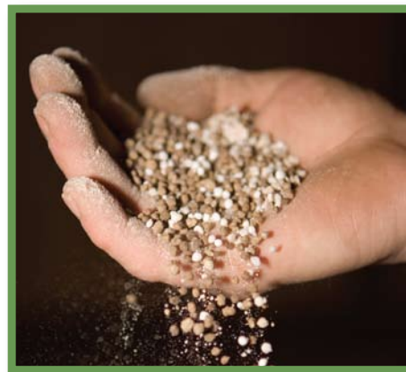
Fertilizer for lawns, trees and shrubs does its best work in the fall.

A heavy fall fertilization, on the other hand, promotes a thicker, stronger root system rather than excessive top growth. This will lead to a greener, more vigorous lawn when spring returns.